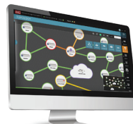
RADview Network Management and Orchestration